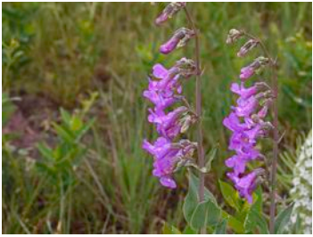
One-sided Penstemon; Figwort family