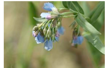
Foothills mertensia; Borage family. Flowers turn pink after pollination.