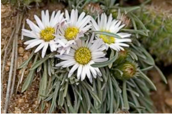
Easter daisy; Sunflower family