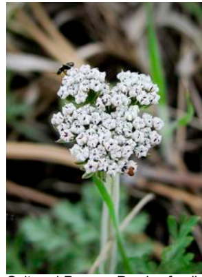
Salt-and-Pepper; Parsley family. Blooms early in spring. Has red anthers.