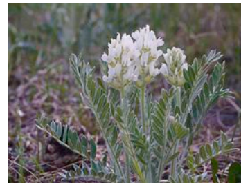
White locoweed; Pea family