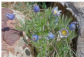
Pasque flower; Buttercup family. Very early season flower. Hairs protect it from wind.