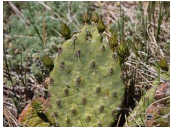
Bigroot Pricklypear Cactus ( Opuntia macrorhiza ) Cactus family