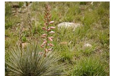
Yucca; Agave family. Fruits, seeds, flowers and stems are edible. Leaves can be used for hanging things. Sometimes can make soap from roots. Not the same as "yuca" or cassava.