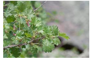
Shrub: Wax Currant; Gooseberry family