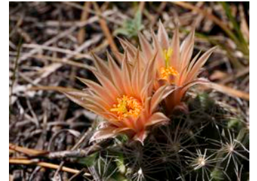
Missouri pincushion cactus; Cactus family