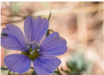
Wild Blue Flax; Flax family. Each flower lasts only one day.