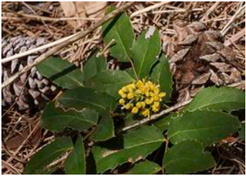
Oregon grape; Barberry family. Fruits tart but edible; inner bark of stems and roots used for yellow dye; berries used for purple dye.