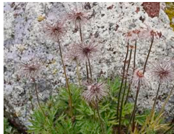
Pasque flower seed heads, similar to a dandelion. Dispersed by wind.