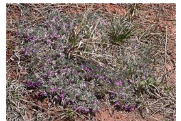
Foothills Milkvetch; Pea family