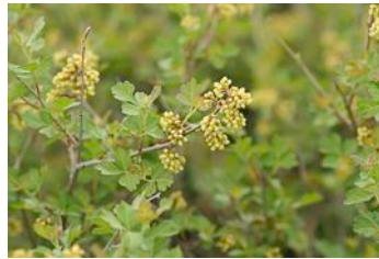
Shrub: Threeleaf sumac; Sumac Family