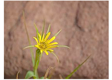
Yellow salsify; Sunflower family