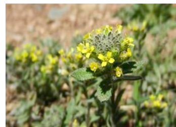
Small-flowered Alyssum; Mustard family.