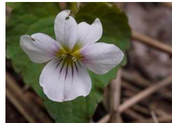
Canada violet; Violet family