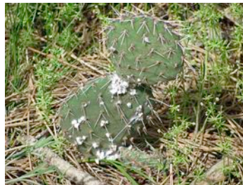
Prickly pear cactus with white fluffy wax produced by cochineal insects. If rubbed between the fingers, the white wax turns carmine red from the dye in the insects.