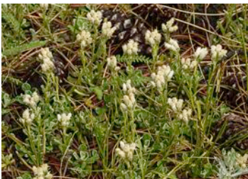
Small-leaf Pussytoes; Sunflower family