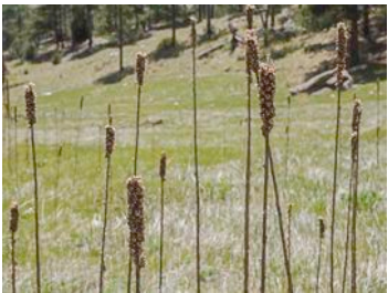
Common mullein, second year; Figwort family