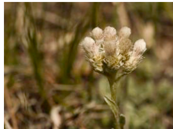
Small-leaf Pussytoes; Sunflower family