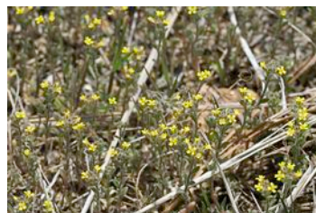
Small-flowered Alyssum; Mustard family. Grows in disturbed areas. Introduced, not native.