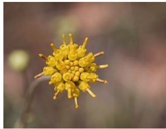
Fineleaf woollywhite; Sunflower Family