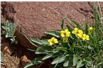
Nuttall's Violet; Violet family. Insects attracted by bright petals; land on bottom petal and follow stripes into the center of the flower. Pollen grains fall on back. Large insects can't enter. Also has flowers on lower stem that are fertile but don't bloom; adaptation to early season.