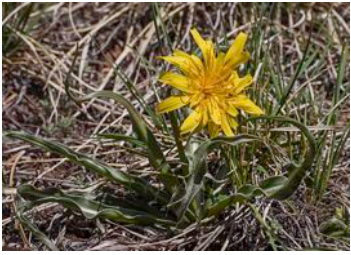
Wavyleaf or false dandelion; Sunflower family. Native.