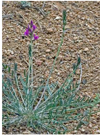
Lambert's Locoweed; Pea family