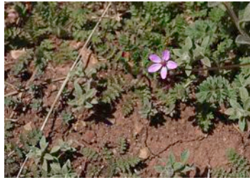
Redstem filaree or Stork's bill; Geranium family. This is a List B noxious weed.