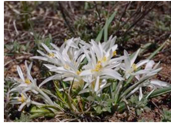
Mountain sand lily; Lily family. In mid-summer, the plant goes underground and is dormant.