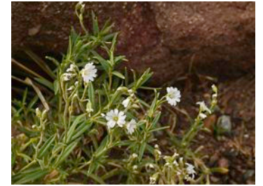
Mouse-ear Chickweed; Chickweed family. Has notched petals.