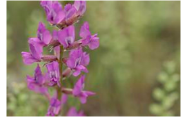
Lambert's Locoweed; Pea family