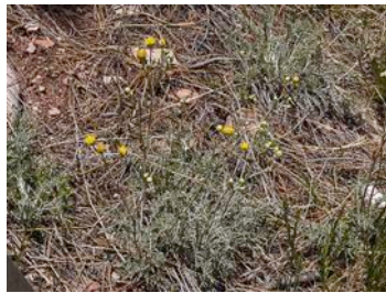
Fineleaf woollywhite; Sunflower Family