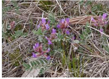
Short's milkvetch; Pea family