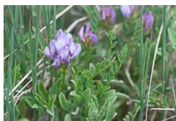
Field Milkvetch; Pea family