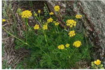
Whiskbroom parsley; Parsley family