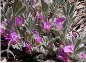
Foothills Milkvetch; Pea family