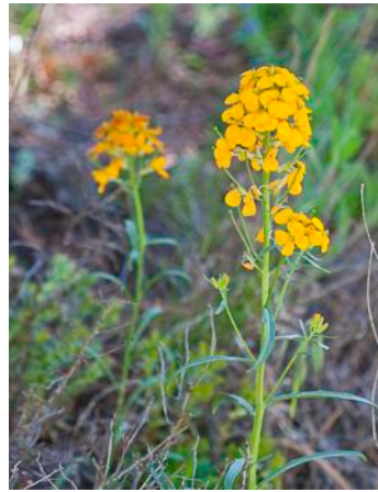
Western Wallflower; Mustard family