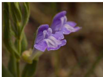
Britton's Skullcap; Mint family