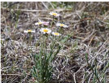
Fleabane; Sunflower family.