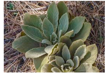
Common mullein, first year; Figwort family