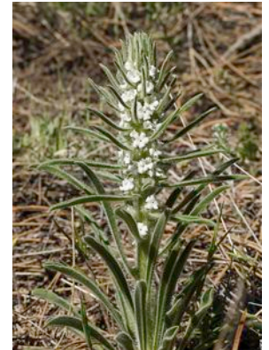
Miner's Candle; Borage family. The flowers spiral around the stalk from the base to the top.