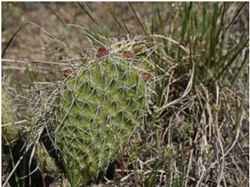
Pricklypear Cactus ( Opuntia polyacantha ) Cactus family