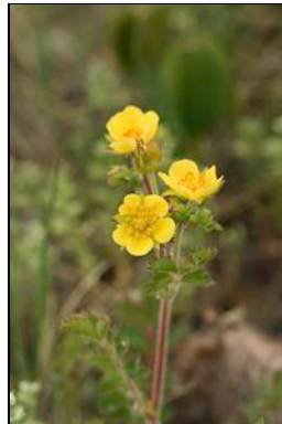
Potentilla pulcherrima (Beautiful Cinquefoil) Rosaceae (Rose Family)