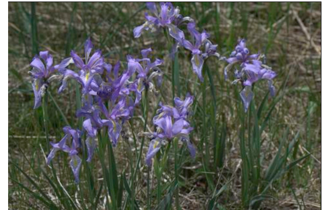
Iris missouriensis (Wild Iris) Family: Iridaceae (Iris)