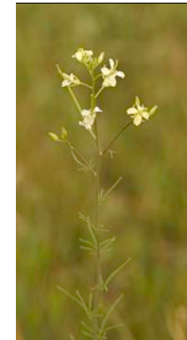
Mountain tansy mustard (Descurainia richardsonii) Mustard family or Brassicaceae