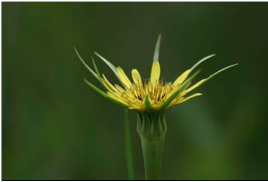
Tragopogon dubius (Yellow Salsify) Asteraceae (Sunflower) Phyllaries extend beyond flower