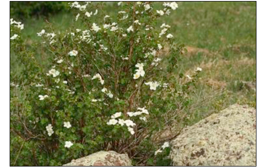
Rubus parviflorus. (Thimbleberry) Rosaceae (Rose Family) Montane, subalpine. Woodlands, disturbed areas. Spring, summer. Leaves have three lobes.