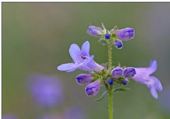
Penstemon virens (Bluemist Penstemon) Family: Scrophulariaceae (Figwort)