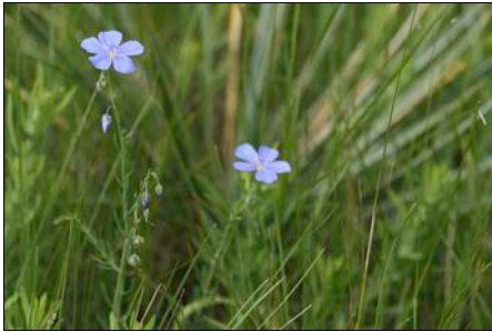
Blue Flax Adenolinum lewisii . Linum lewisii . Linaceae (Flax Family) Tall, slender stems with many buds. Only one opens each day.