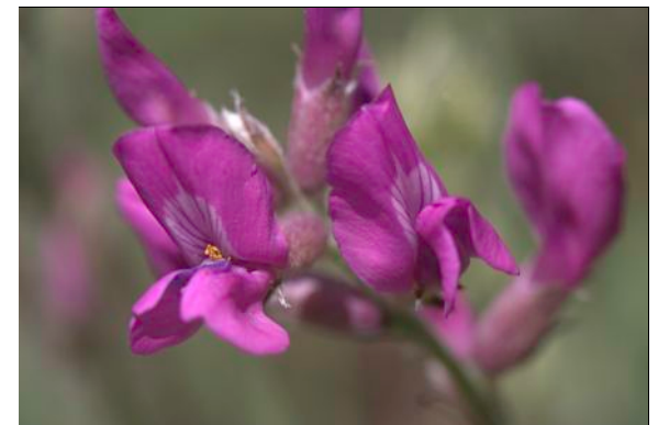
Oxytropis lambertii (Lambert's Locoweed) Family: Fabaceae (Pea)