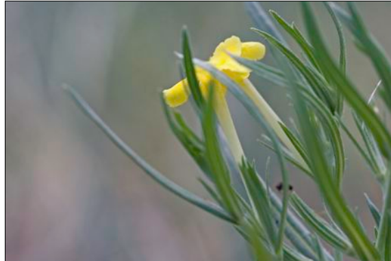
Lithospermum incisum (Narrowleaf Puccoon) Family: Boraginaceae (Borage)