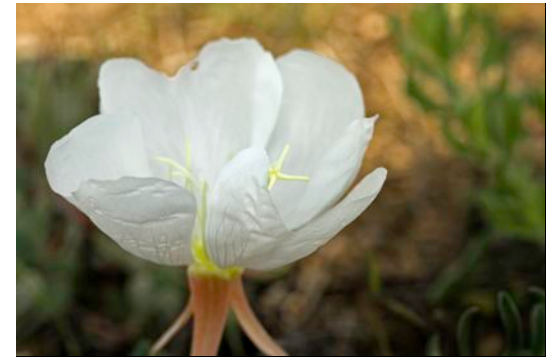
Oenothera caespitosa (Tufted Evening Primrose) Family: Onagraceae (Evening Primrose). Large flowers, low to the ground.