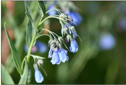
Mertensia lanceolata (Bluebells) Boraginaceae (Forget-Me-Not Family) Foothills to alpine. Woodlands, meadows, openings. Spring, summer.