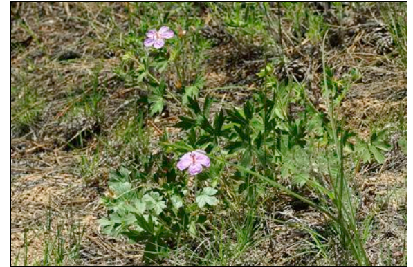
Geranium caespitosum (Parry Geranium) Family: Geraniaceae (Geranium)