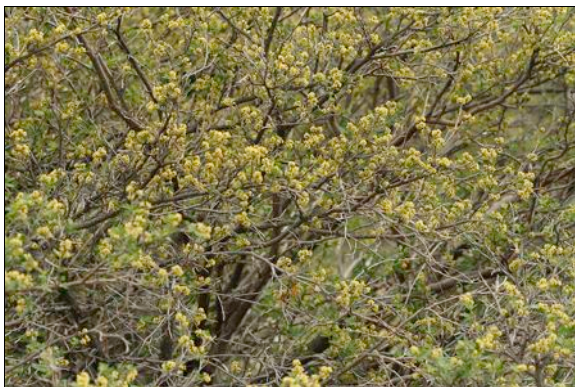
Rhus aromatica or Rhus trilobata (Threeleaf sumac) Anacardiaceae (Sumac Family)