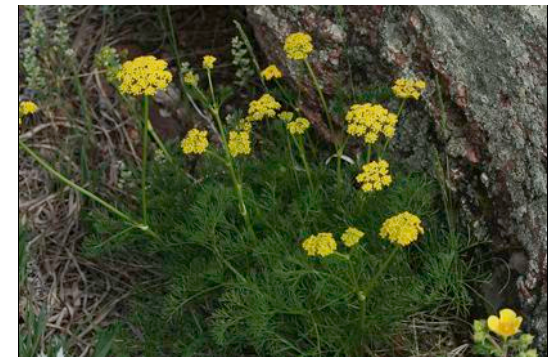
Aletes tenuifolius or Musineon tenuifolium (Slender Wildparsley) Apiaceae (Parsley family)