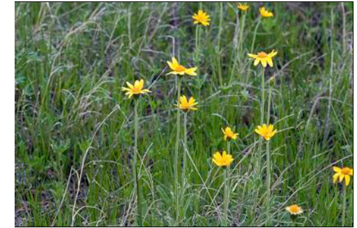
Arnica fulgens (Foothill Arnica) Family: Asteraceae (Sunflower) Common in meadows and rocky slopes; follow the sun; opposite leaves with parallel veins; hairy bracts with purplish tips