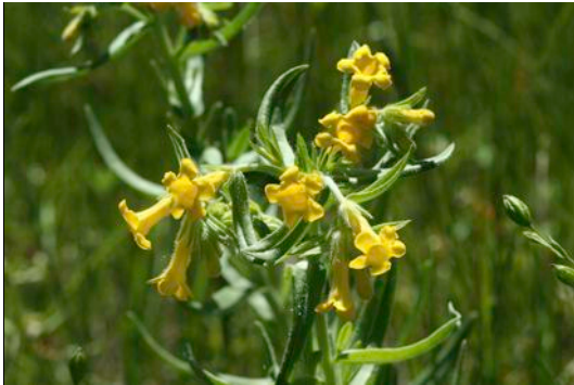
Lithospermum multiflorum (Puccoon) Boraginaceae (Forget-Me-Not Family) Clumpy growth pattern, shorter tube than L. incisum