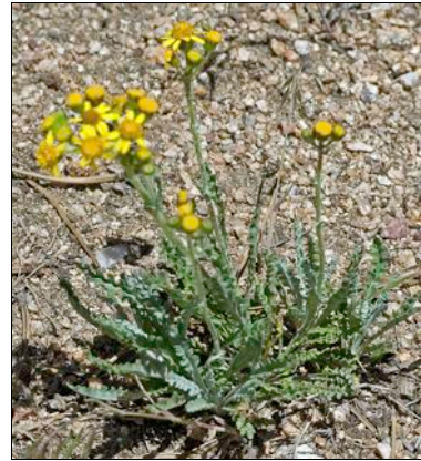
Senecio sp. Aster or Asteraceae family.