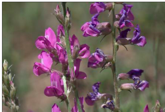
Oxytropis lambertii (Lambert's Locoweed) Family: Fabaceae (Pea) Plant seems to have different forms.