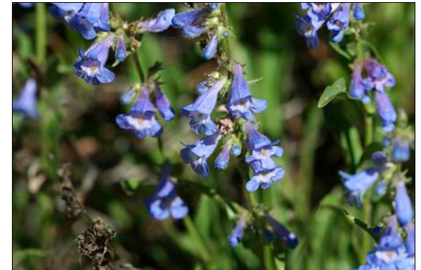
Penstemon virens (Bluemist Penstemon) Family: Scrophulariaceae (Figwort)