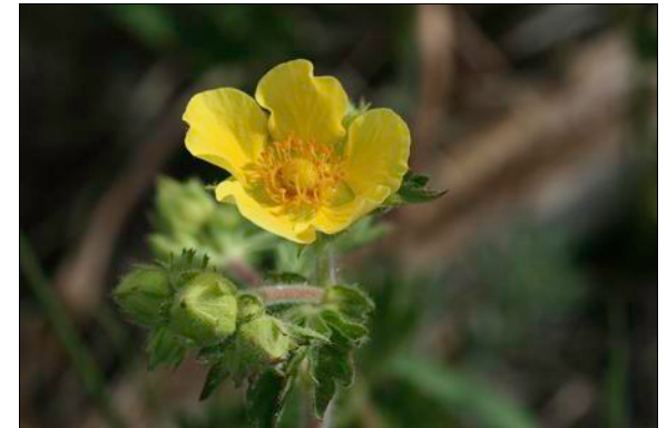
Potentilla pulcherrima (Beautiful Cinquefoil) Rosaceae (Rose Family)