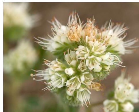
Phacelia heterophylla (Scorpionweed) Family: Hydrophyllaceae (Waterleaf)