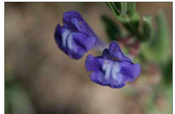
Skullcap ( Scutellaria brittonii ) Family: Lamiaceae (Mint)