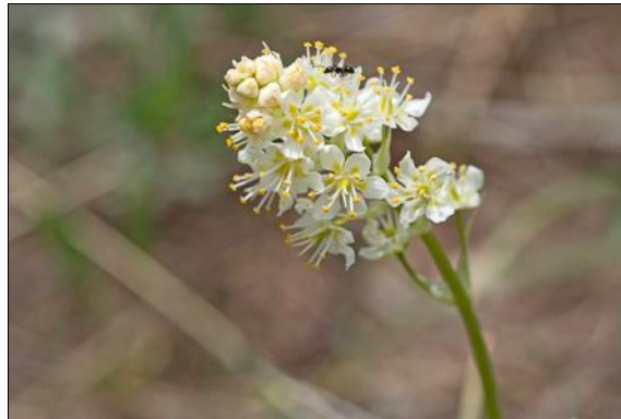
Toxicoscordion venenosum (Death Camas) Family: Melanthiaceae (False Hellebore)