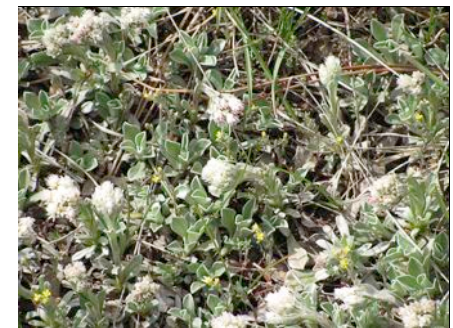
Antennaria parvifolia (Small-leaf Pussytoes) Family: Asteraceae (Sunflower) Mat-forming; leaves hairy on both sides; no pink in flowers; male and female plants separate