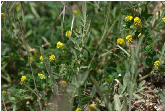
Medicago lupulina (Black Medic) Family: Fabaceae (Pea)