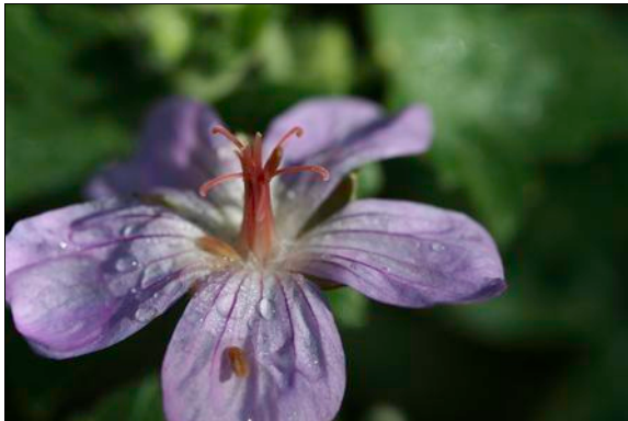
Parry Geranium ( Geranium caespitosum ) Family: Geraniaceae (Geranium)