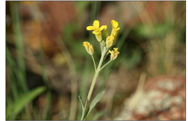
Draba. MUSTARD OR BASSICACEAE FAMILY