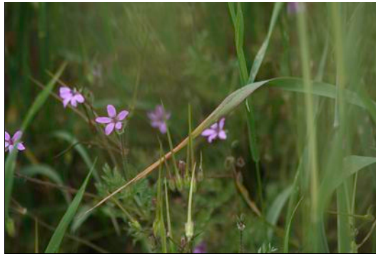
Redstem Filaree or Stork's Bill. Erodium cicutarium . Geraniaceae (Geranium family).