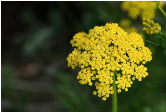
Aletes tenuifolius or Musineon tenuifolium (Slender Wildparsley) Apiaceae (Parsley family)