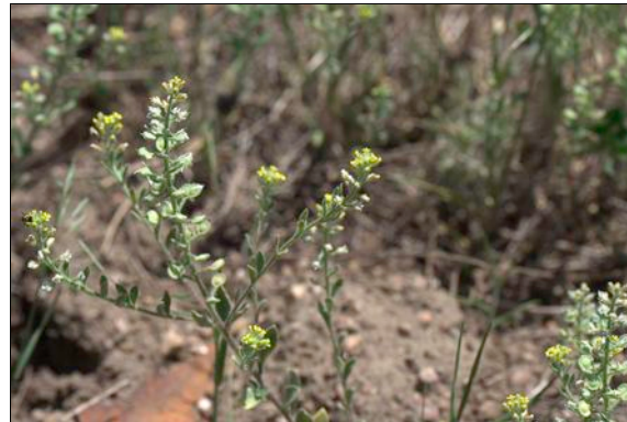
Alyssum parviflorum or Alyssum minus (Small-flowered Alyssum) Family: Brassicaceae (Mustard)