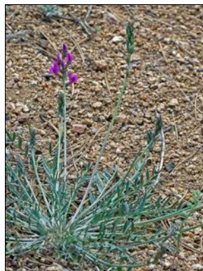
Oxytropis lambertii (Lambert's Locoweed) Family: Fabaceae (Pea) Plant seems to have different forms.