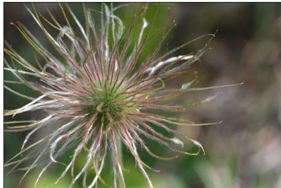
Pulsatilla ludoviciana (Pasqueflower) Ranunculaceae (Buttercup)