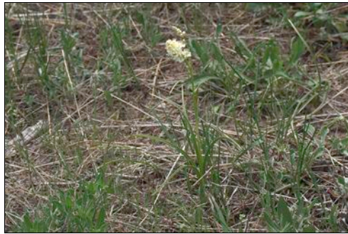
Toxicoscordion venenosum (Death Camas) Family: Melanthiaceae (False Hellebore) All parts of the plant are poisonous to both livestock and humans; Navajo used it to treat coyote bites.