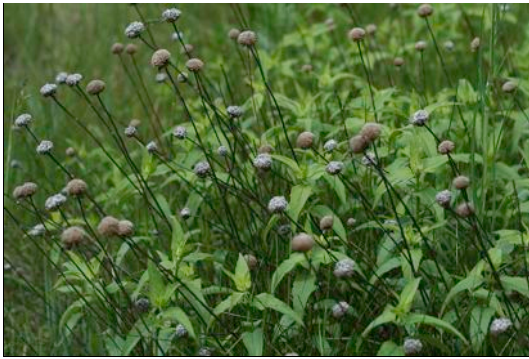
Monarda fistulosa (Beebalm) Family: Lamiaceae (Mint) Coulson Gulch June 21 2009