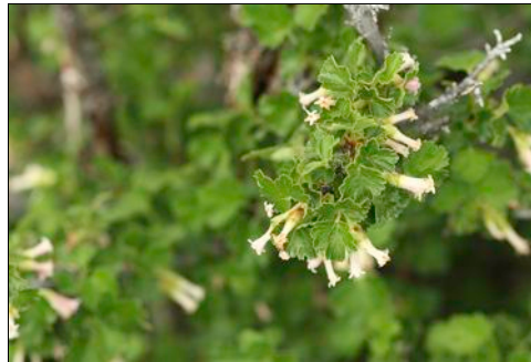
Ribes cereum . Synonym: Ribes inebrians . (Currant) Grossulariaceae (Gooseberry Family) Foothills, montane, subalpine. Woodlands, canyons, rocky areas. Spring.