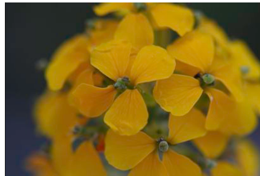
Erysimum capitatum (Western Wallflower) Family: Brassicaceae (Mustard) Four petals in a cross; six stamens (4+2)