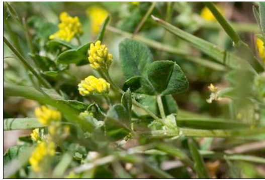
Medicago lupulina (Black Medic) Family: Fabaceae (Pea) Small plant, fairly low to the ground