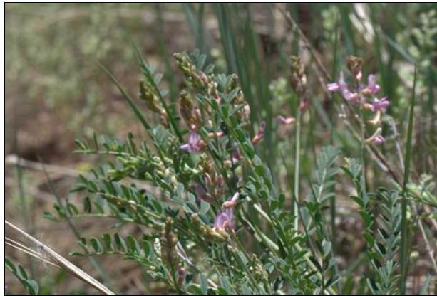
Astragalus sp. Family: Pea or Fabaceae