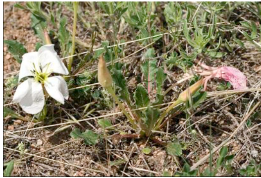
Oenothera caespitosa (Tufted Evening Primrose) Family: Onagraceae (Evening Primrose). Large flowers, low to the ground.