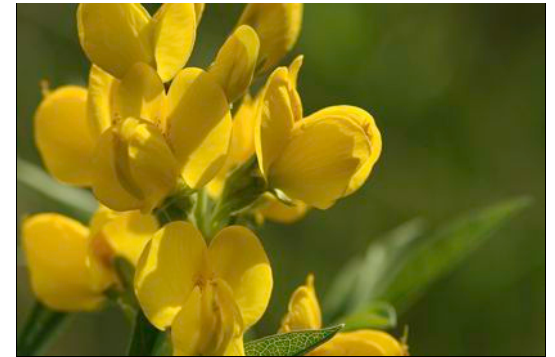
Thermopsis ssp (Golden Banner) Fabaceae (Pea Family) Species identified by pea pod