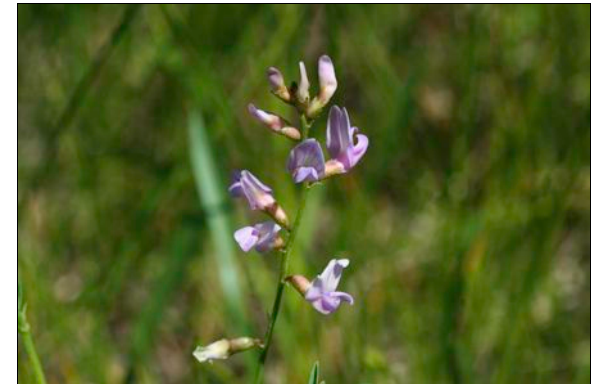
Astragalus flexuosus (Wiry Milkvetch) Family: Fabaceae (Pea)