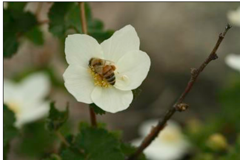
Rubus parviflorus. (Thimbleberry) Rosaceae (Rose Family) Montane, subalpine. Woodlands, disturbed areas. Spring, summer. Leaves have three lobes.