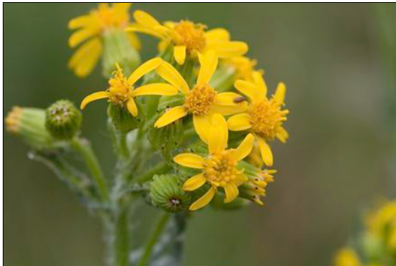
Woolly Groundsel (Packera cana) Aster Family (Asteraceae)