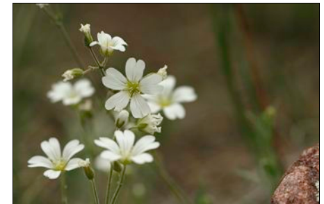
Cerastium strictum (Mouse-ear chickweed) Alsiniaceae (Chickweed Family) Only chickweed where the sepals are much shorter than the petals. Foothills and montane.