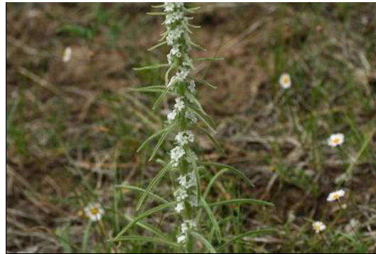
Oreocarya virgata or Cryptantha virgata (Miner's Candle) Family: Boraginaceae (Borage)