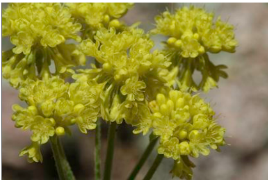
Eriogonum umbellatum (Sulphur Flower) Family: Polygonaceae (Buckwheat) Flowers long lasting; dry with shades of red