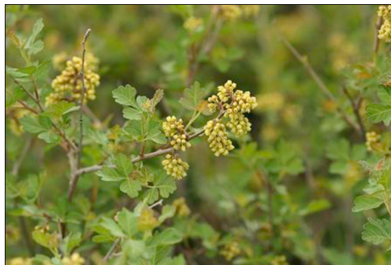
Rhus aromatica or Rhus trilobata (Threeleaf sumac) Anacardiaceae (Sumac Family)