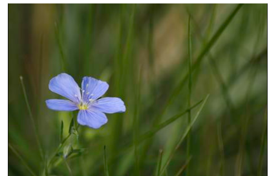
Blue Flax Adenolinum lewisii or Linum lewisii . Linaceae (Flax family)