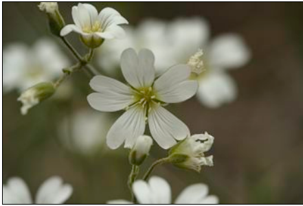
Cerastium strictum (Mouse-ear chickweed) Alsiniaceae (Chickweed Family) Only chickweed where the sepals are much shorter than the petals. Foothills and montane.