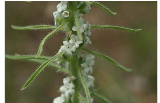
Oreocarya virgata or Cryptantha virgata (Miner's Candle) Family: Boraginaceae (Borage)