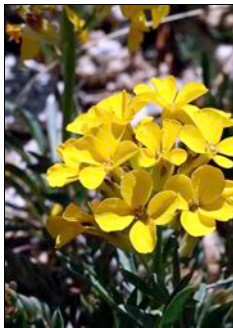
Wallflower (Erysimum capitatum). Mustard family (Brassicaceae). ID: Simple leaves; large flowers (over 1 cm); four petals, four sepals, six stamens (4+2); superior ovary.