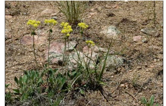
Eriogonum umbellatum (Sulphur Flower) Family: Polygonaceae (Buckwheat) Flowers long lasting; dry with shades of red