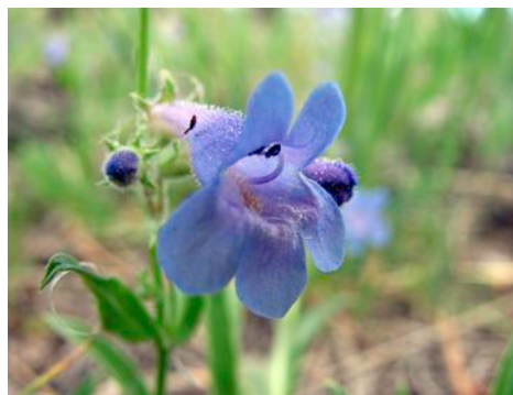
Penstemon virens (Bluemist Penstemon) Family: Scrophulariaceae (Figwort) Common; grows on rocky areas; flowers grow all around the stem