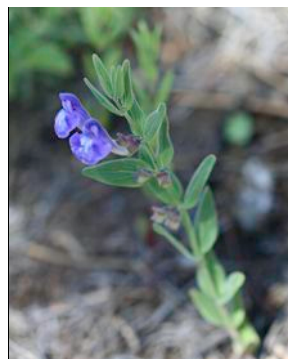
Skullcap ( Scutellaria brittonii ) Family: Lamiaceae (Mint) Hint: obvious white teeth chew off hair . . .