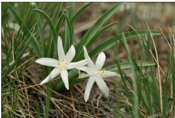
Leucocrinum montanum (Mountain sandlily) Liliaceae (Lily Family)