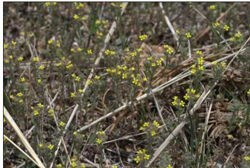
Alyssum parviflorum or Alyssum minus (Small-flowered Alyssum) Family: Brassicaceae (Mustard)