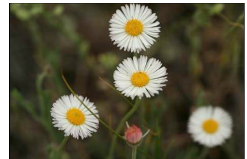
Erigeron colomexicanus, Erigeron divergens variety cinereus. Erigeron tracyi. Asteraceae (Sunflower Family) Foothills. Openings, woods. Spring.