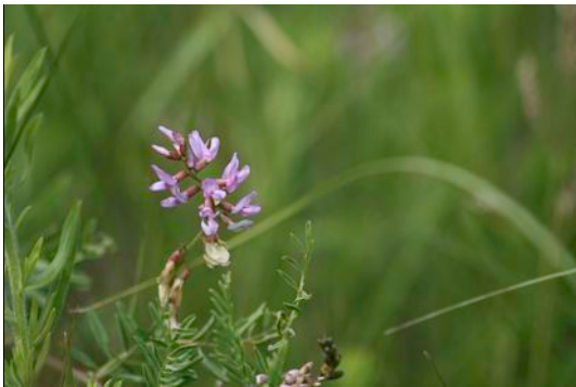
American vetch Vicia americana Pea family