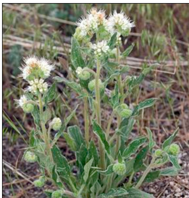
Phacelia heterophylla (Scorpionweed) Family: Hydrophyllaceae (Waterleaf)