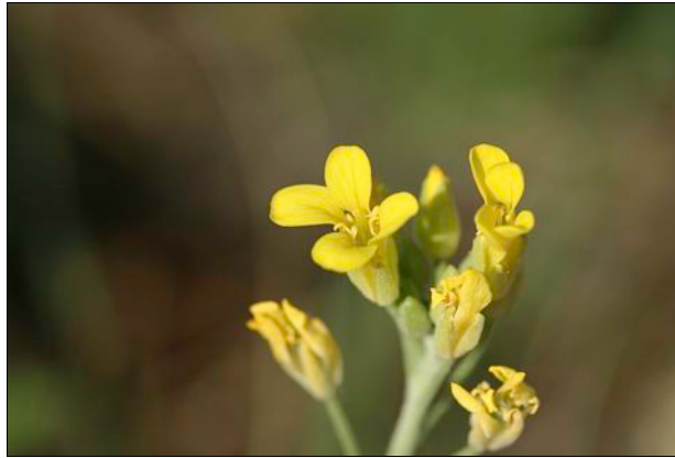
Draba. MUSTARD OR BASSICACEAE FAMILY.