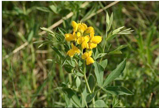
Thermopsis ssp (Golden Banner) Fabaceae (Pea Family) Species identified by pea pod